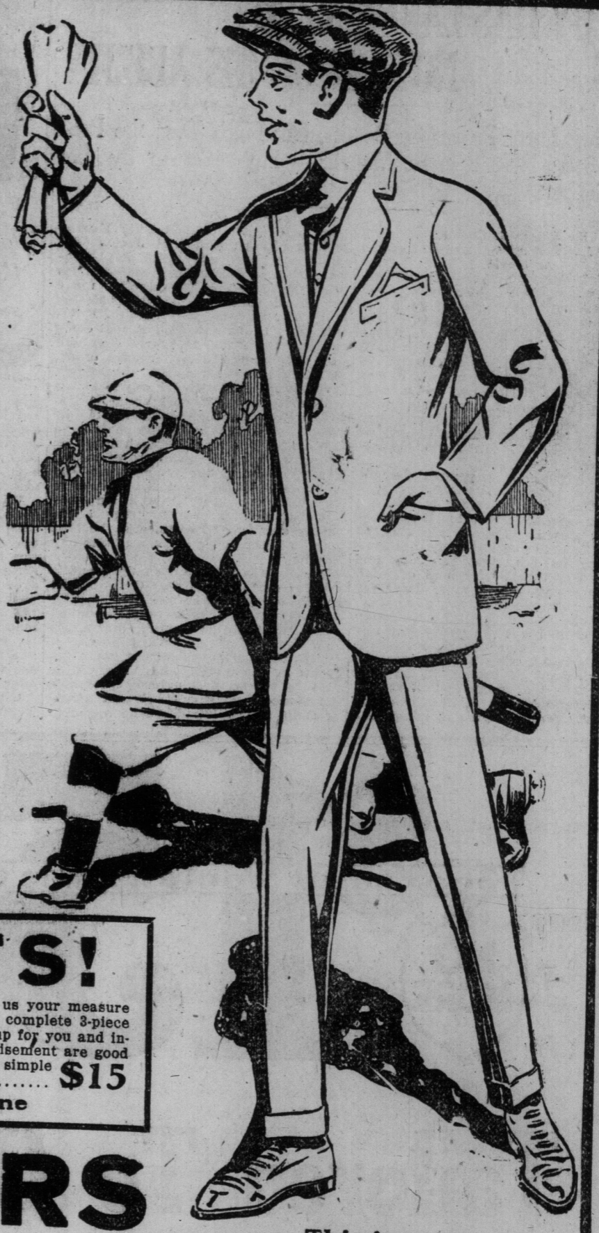
This is a REGAL TAILORS Style—to your measure for $15

Any Suiting in the Store to Your Personal Measure $15