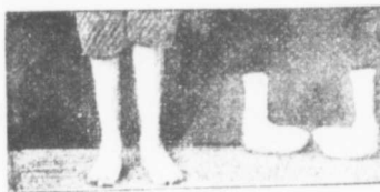
Fig. 3.—After. Fig. 3.—Before.