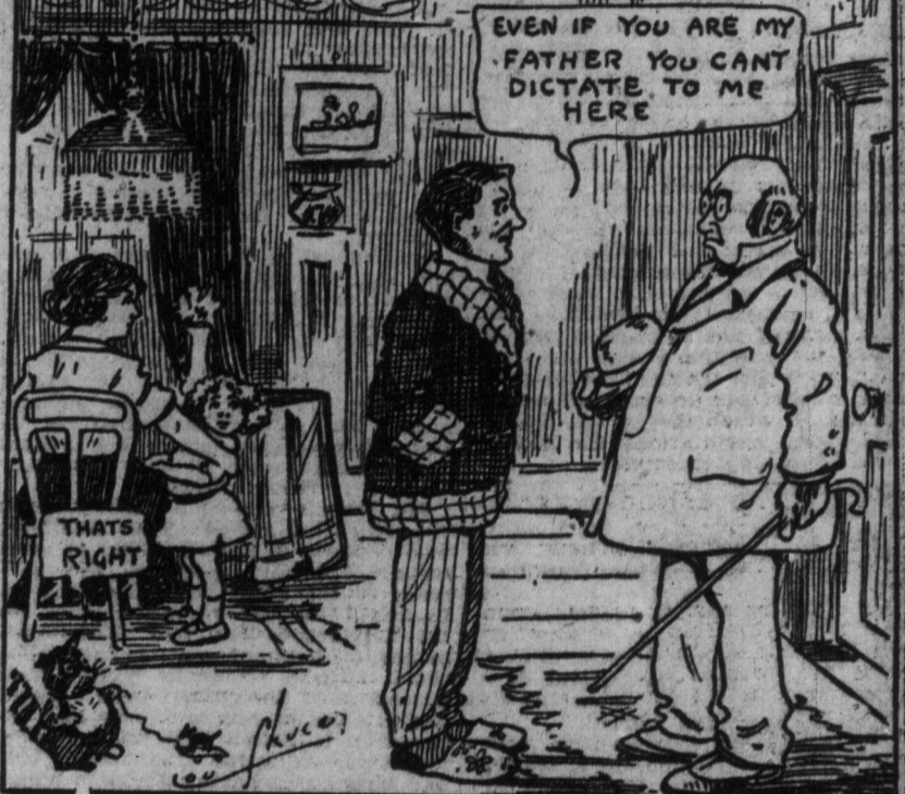
TORONTO WORLD'S PROVERB PICTURE NO. 58