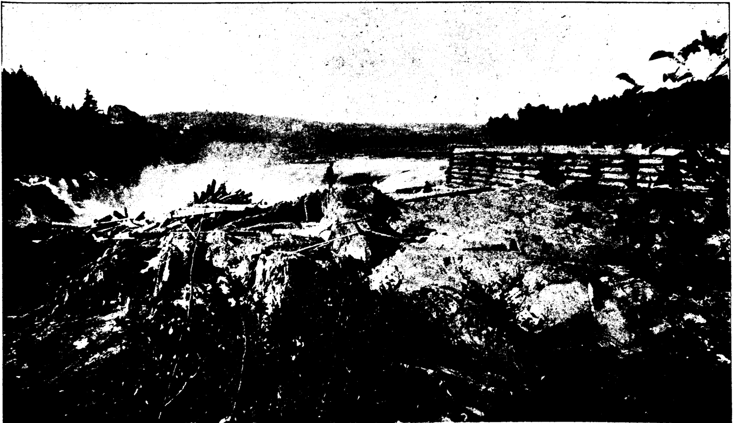
FALLS FROM THE EDMONTON ROAD.