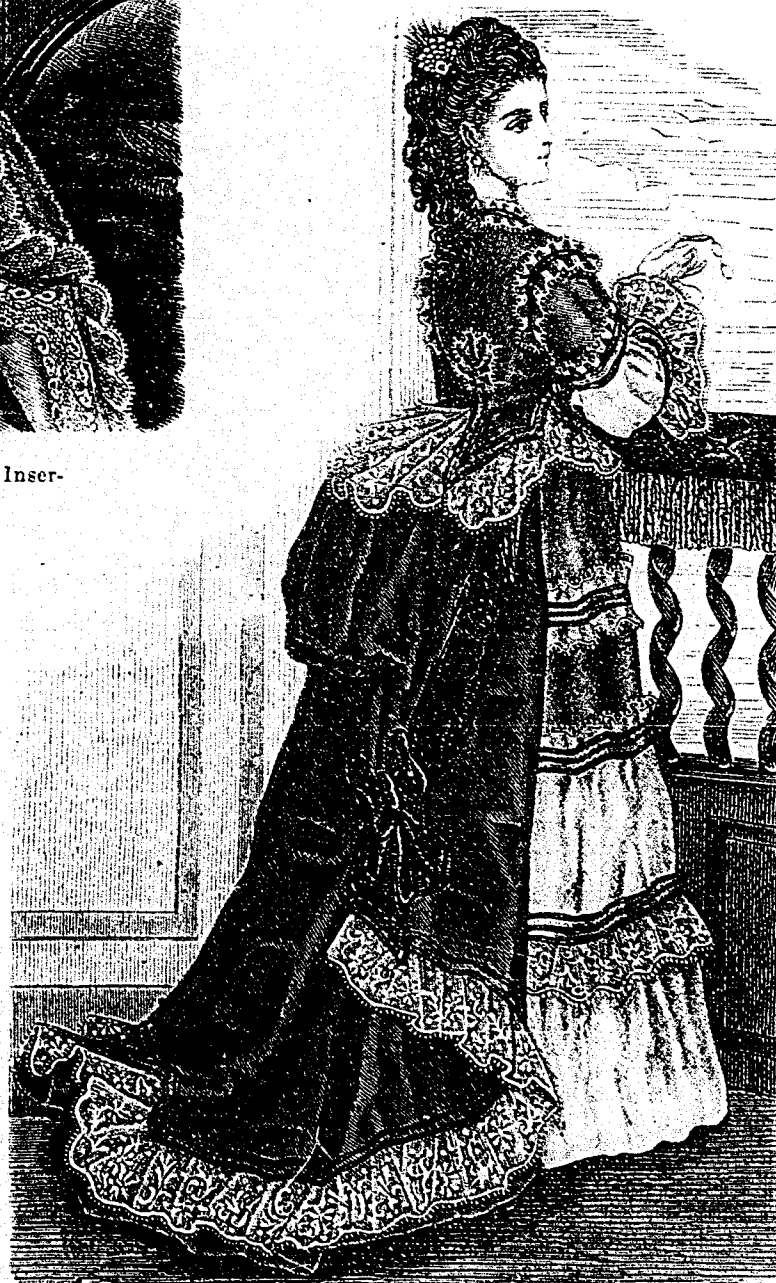
FIG. 9.—Evening Dress.