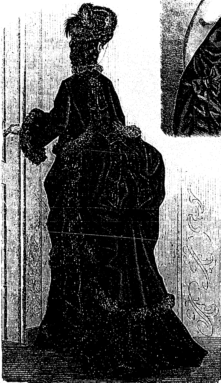
FIG. 8.—Visiting Toilette.