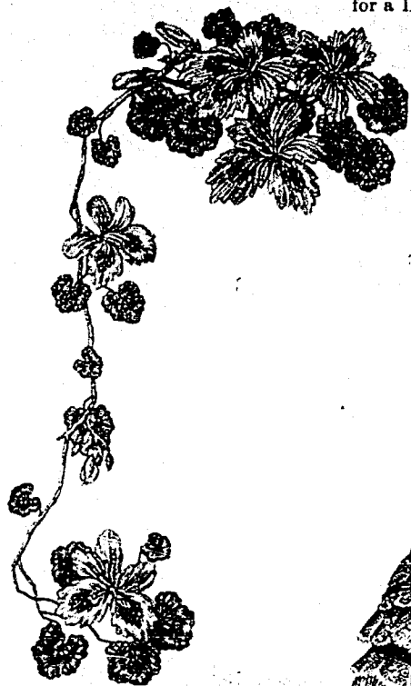
FIG. 5.—Pelargonium Coiffure.