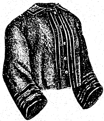
FIG. 2 a.—Blouse for Girls of 12 to 15. Front.