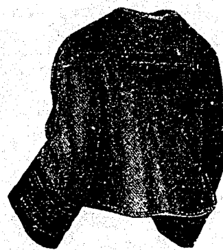
FIG. 2 b.—Blouse for Girls of 12 to 15. Back.