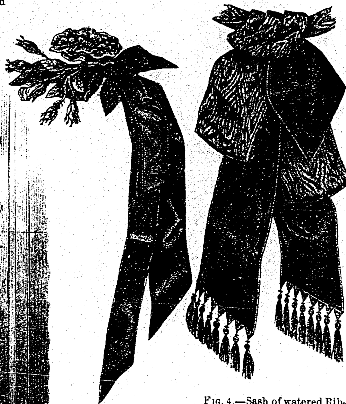
FIG. 4.—Sash of watered Ribbon and Velvet Ribbon.