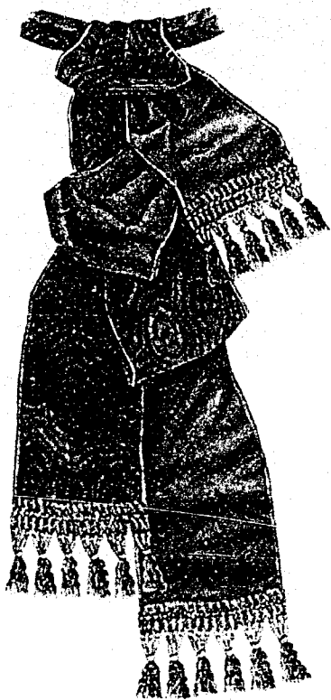
FIG. 3.—Sash of watered Ribbon and Rep Ribbon.