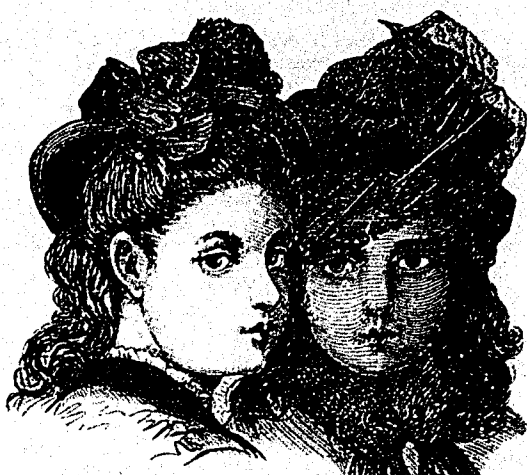
FIG. 1 a.—Rubens Hat for a Little Girl.