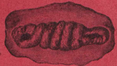
A Strand of Lead Wool coiled up for transit