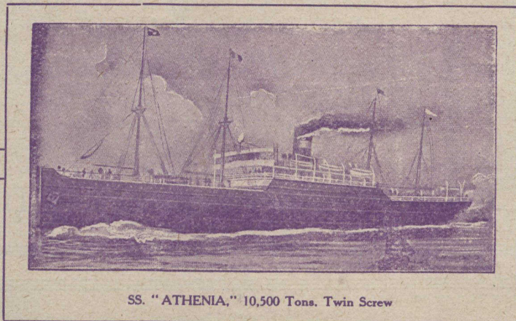
SS. "ATHENIA," 10,500 Tons. Twin Screw