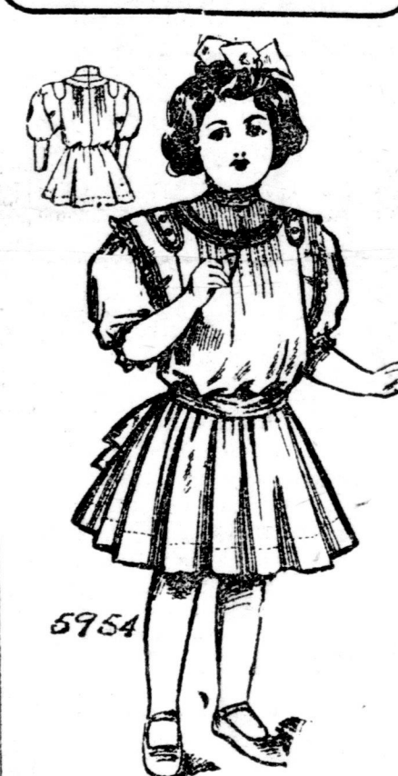
A CHARMING GOWN FOR A LITTLE MAID—5954.

The vogue of the mandarin sleeve is as much to be noted among the styles for little girls as among their elders, and exceedingly quaint and charming are some of the models shown. One is developed in white challis. It is simple and girlish and very becoming. The waist blouses prettily all around, and is attached to the full-gathered skirt, which is simply finished by a deep hem and the under sleeves and gumpie are of lawn dotted Swiss or China silk. Any of the stylish plaids and checks, as well as cashmere and albatross, are suggested for the making of the dress. For a child of 8 years, 3½ yards of 36 inch material will be required for the dress.