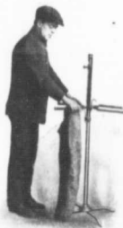
International BAG HOLDER

Vertical drawn cores allow the use of much wetter material than is otherwise possible, making stronger, more dense and moisture-proof blocks.