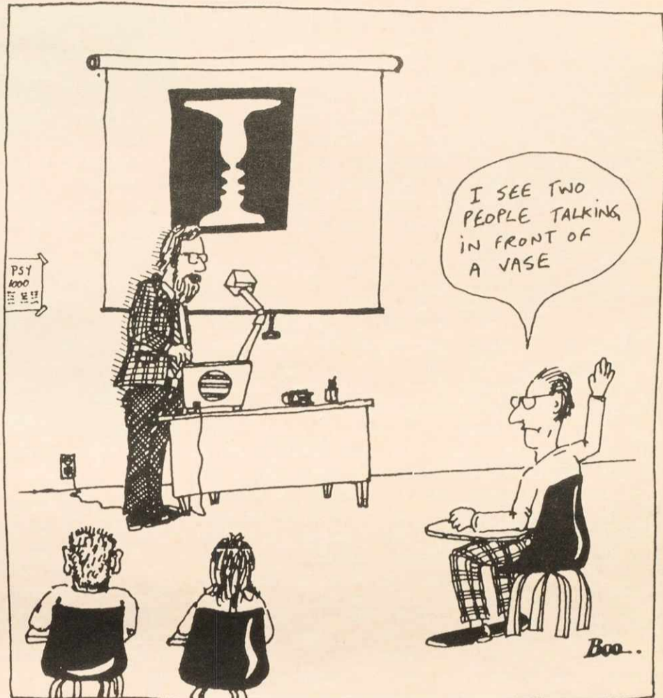
BERNIE UNWITTINGLY DISPROVES THE GESTALT FIGURE-GROUND PRINCIPLE