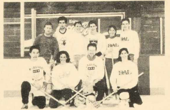
CO-ED BROOMBALL 'B' CHAMPS LAW