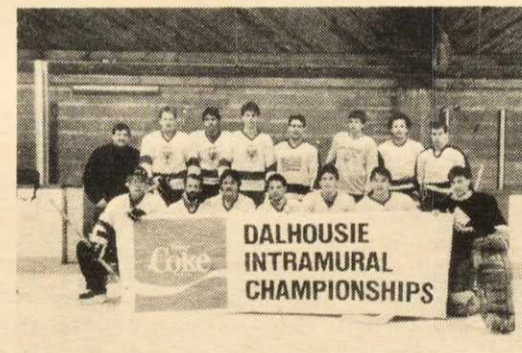
"B" HOCKEY CHAMPS MBA