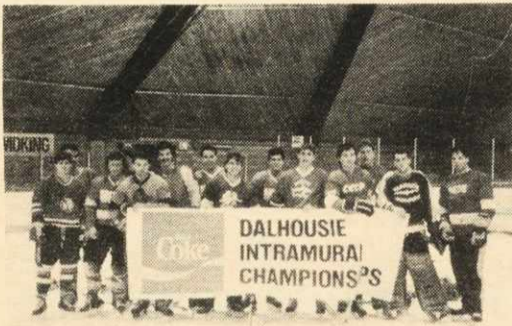
"A" HOCKEY CHAMPS MEDICINE