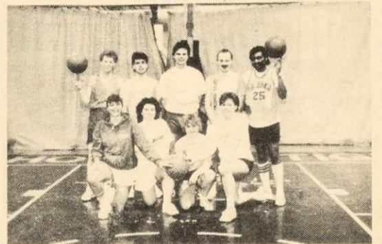
CO-ED 'B' BASKETBALL CHAMPS SPUDS