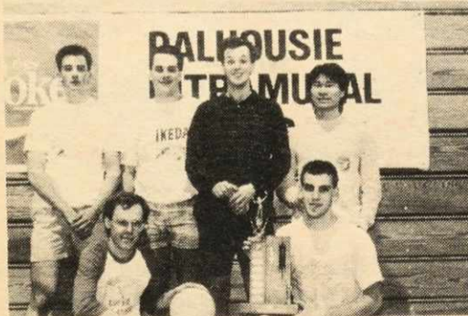
MEN'S 'B' VOLLEYBALL CHAMPS PIG DOGS UNITED