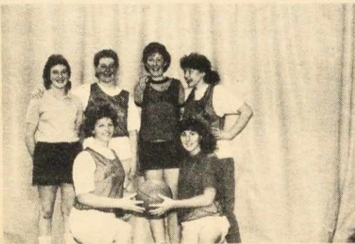
WOMEN'S BASKETBALL CHAMPS NURSING