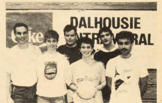
CO-ED VOLLEYBALL CHAMPS DENTISTRY