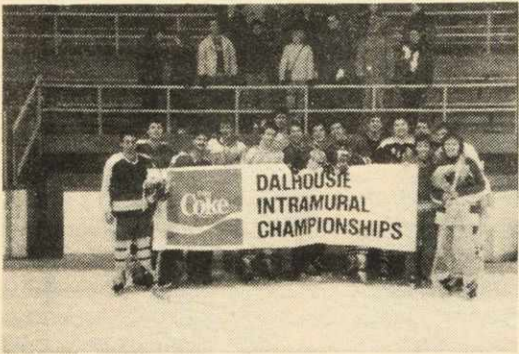
GENTLEMEN'S LEAGUE HOCKEY CHAMPS LAW