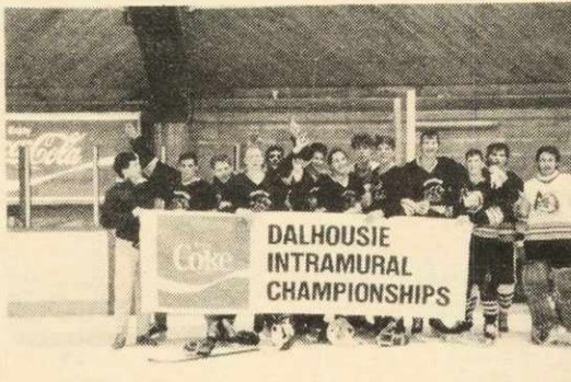
RESIDENCE HOCKEY CHAMPS HENDERSON