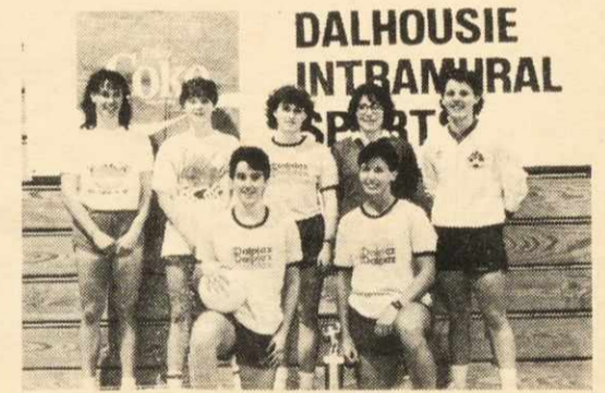
WOMEN'S VOLLEYBALL CHAMPS NADS (WOMEN'S VARSITY SOCCER)