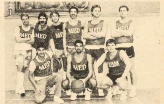
BASKETBALL 'A' CHAMPS MEDICINE