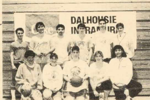
CO-ED BASKETBALL RESIDENCE CHAMPS HENDERSON/SH