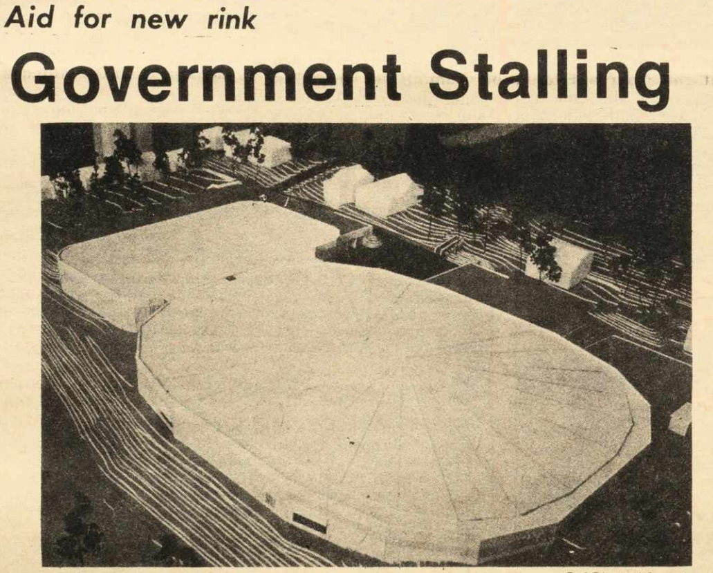
A model of the Dalplex with a proposal for a new rink.