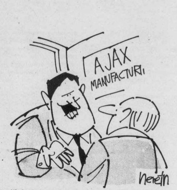
"I think the safety record of our plant is excellent especially when you consider how dangerous it is to work there."