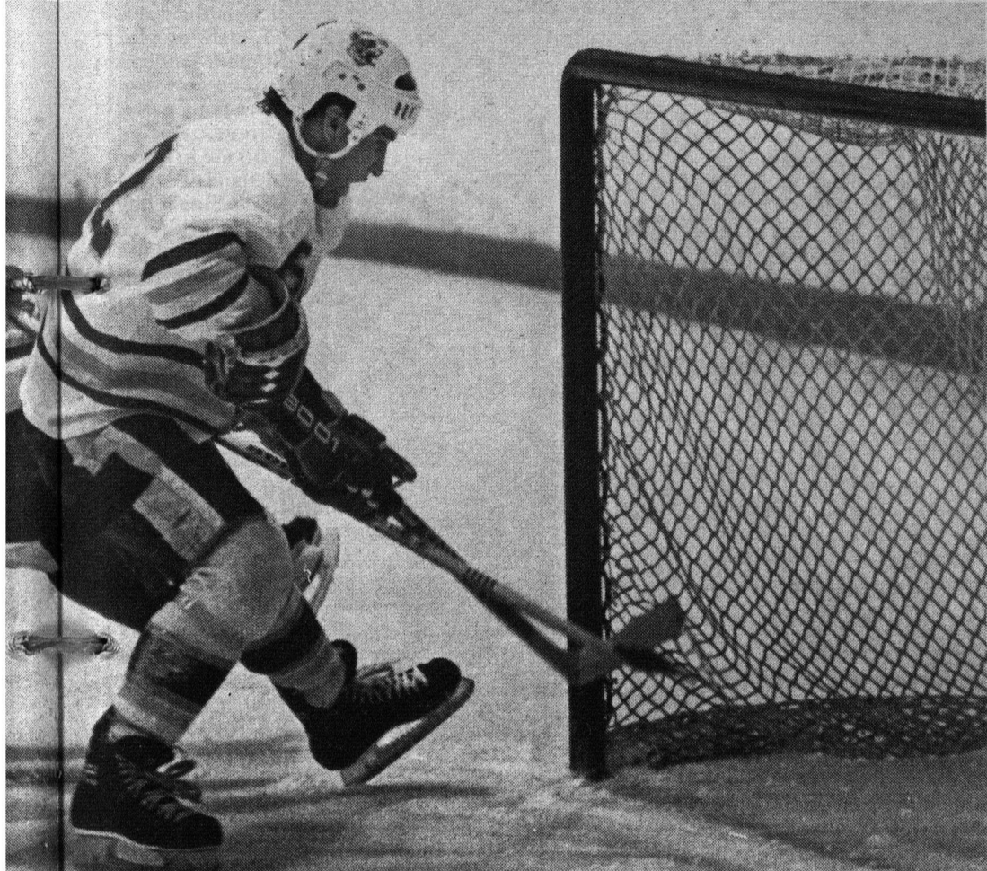
the best group since I've been with the team."

being successful and knowing that you are going to be successful is back again. And that goes a long way. It comes with confidence and it comes a little bit from winning but it's there. That's the biggest similarity.