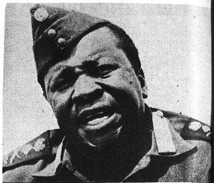
Big Daddy will be leading a class in advanced group groping for Ed Psych grad students.

"I don't care how fresh it is, I'm not eating dog shit."