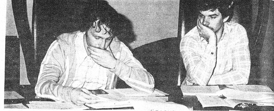
Die Bored. Sometimes it takes a long time to make a decision. It took an hour and a half to decide the fate the "enforcement of the constitution and bylaws of the students' union." It has the power to annul any motion of any student organization which conflicts with the constitution and

The D.I.E. Board is also accountable for