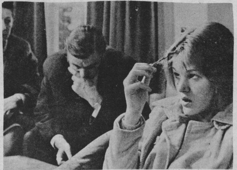
Concerned parents and their rebellious daughter generate the beginnings of a tragedy in the British film, Wednesday's Child , a presentation of the Edmonton Film Society at SUB Theatre Feb. 17, 8 p.m. Series tickets available at the door.

Hal Ashby, the filmmaker who gave us "The Last Detail", is currently working on a film about the late 1960's called "Shampoo." That film will be filled with music of the period, including songs by the Mamas