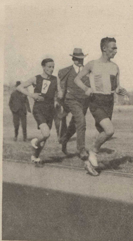
Woods (2) with his father running beside him