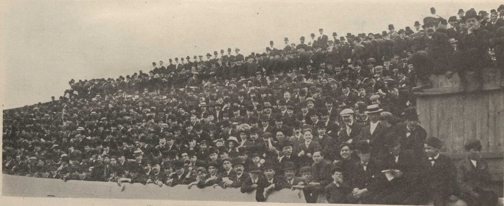
The crowd which filled the M.A.A.A. bleachers till they overflowed.