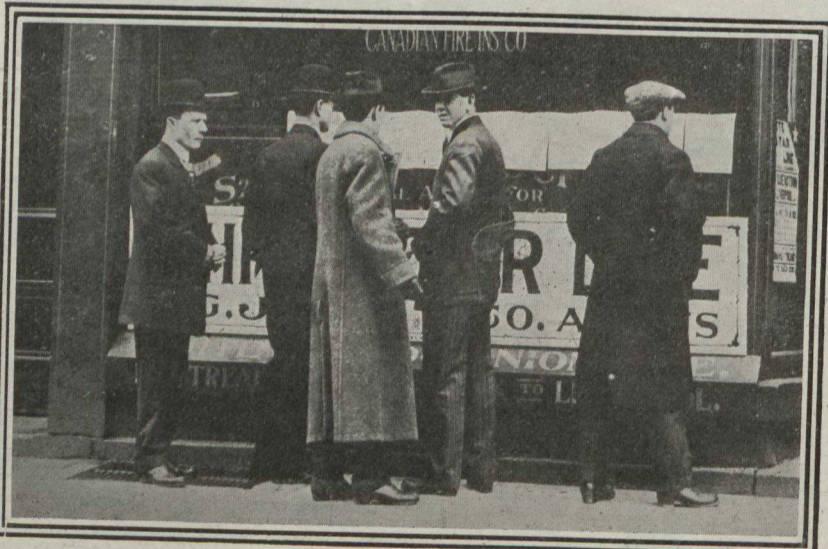
Reading Bulletins from "Morgue Ship," at White Star Line Office, Halifax.