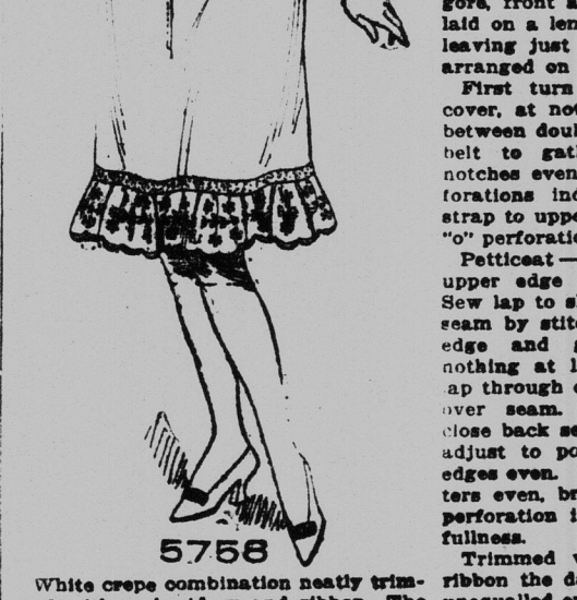
5758 White crepe combination neatly trimmed with embroidery and ribbon. The corset cover is in one piece.