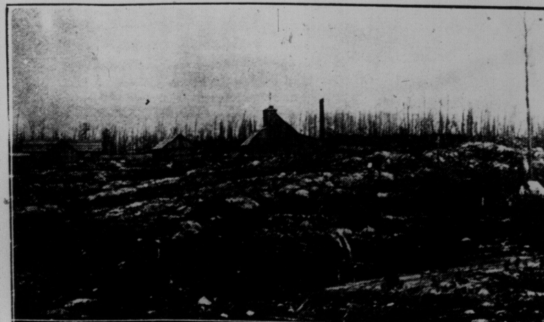
STRETCH OF ROCK AND POWER HOUSE IN MUNRO MINING DISTRICT, NORTH ONTARIO.