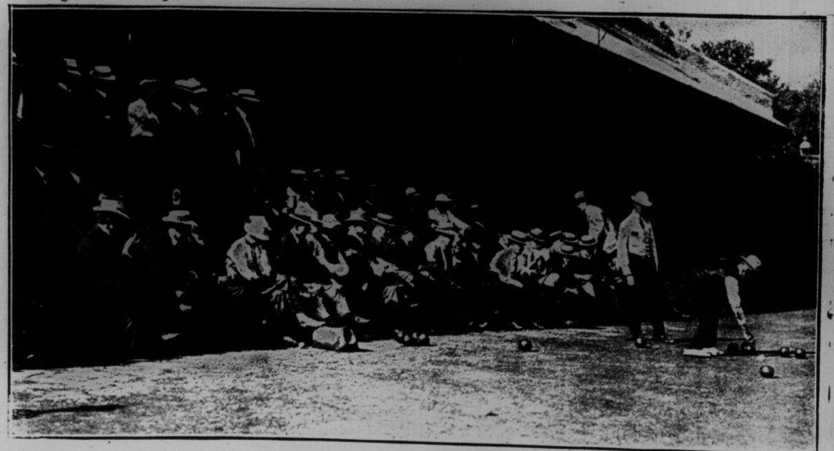
CITY BOWLING CHAMPIONSHIP—CARNAHAN'S GRANITES ROLLING ON THE GRANITE RINK.