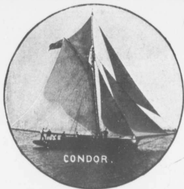
LIFE ON THE OCEAN WAVE.