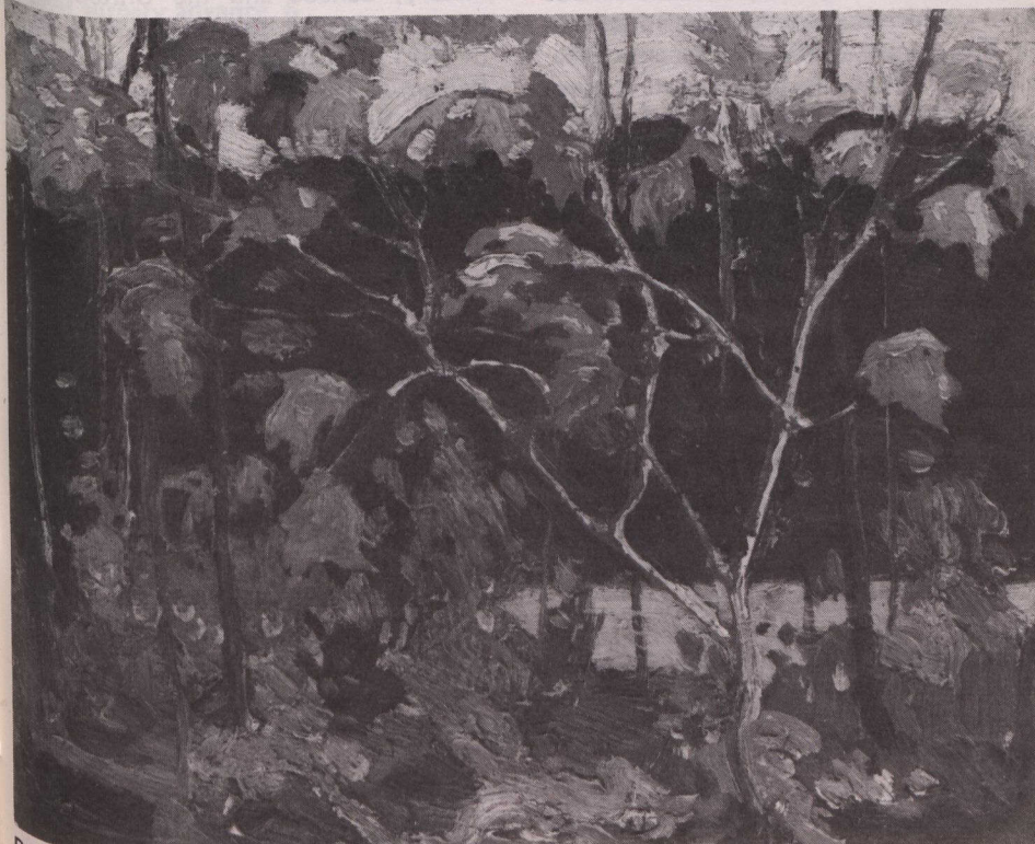
Red Leaves by Tom Thomson is also part of the exhibit.

Twentieth-Century Canadian Painting covers the period 1900 to the present and comprises 88 works by twenty-five artists, including Tom Thomson, Emily Carr,