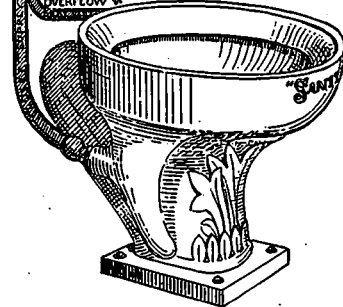
The Sanitas Water Closet.