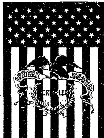
The Copp, Clark Co., Limited

A decided novelty which promises to be a real success is the "Magic" painting