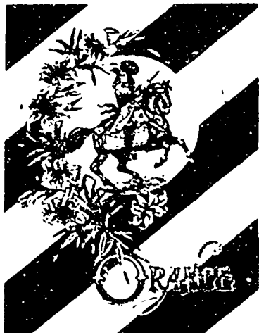
The Copp, Clark Co., Limited

FANCY GOODS AND STATIONERY ... and children's papeteries with colored litho. headings. Also, the above-line of paper by the ream, and envelopes to match, up-to-date lines of notepaper, etc., with white,