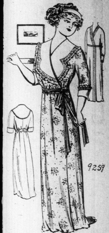
Ladies' Kimono, with Long or Shorter Sleeve, and with or without Collar (in Raised or Normal Waistline).

PRETTY EFFECTIVE LOUNGING OR HOUSE GOWN.