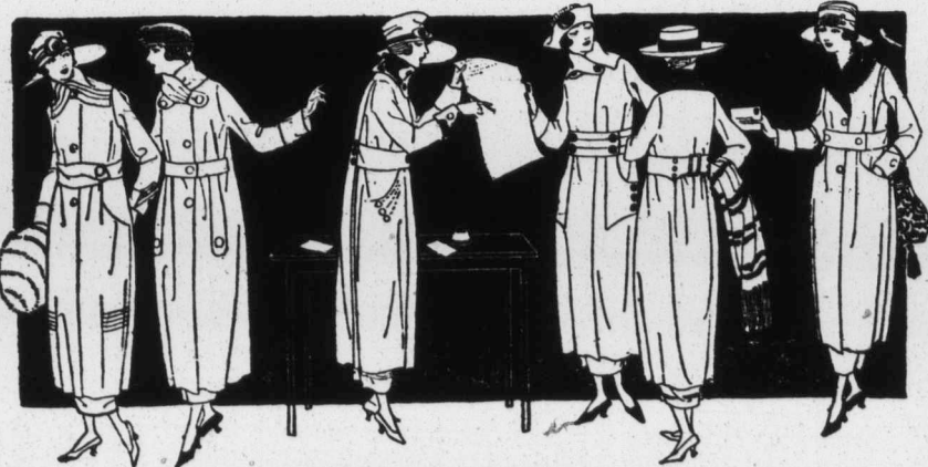
A Most Unusual Selling of