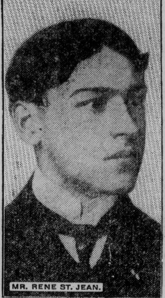
A Resident of Ottawa Finds Relief in Pe-ru-na.