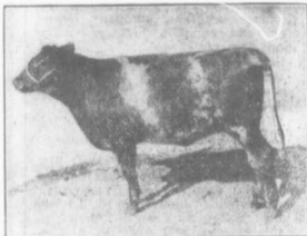
One that competed for our Special Prize—60 lbs. at 6 mos.

Equally as good results when fed to Horses, Hogs and Cattle.