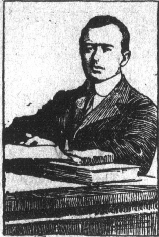
CAPTAIN R. F. SCOTT.

The relief party found the Discovery on Jan. 23 in MacMurdo Bay, Victoria Land. The expedition wintered 400 miles further south than any vessel had previously done, and Captain Scott, with Dr. Wilson and Lieutenant Shackleton, penetrated