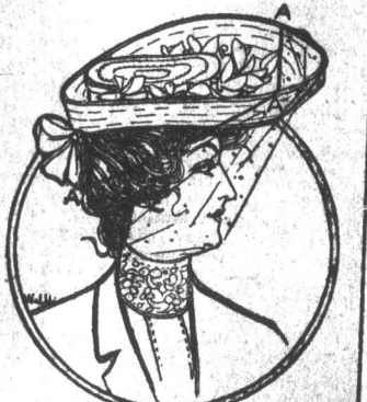
SECURING THE BIG HAT.

I have heard it said there is money awaiting the woman who will patent a device for keeping on a large hat while driving in the wind. My neighbor offers the following original idea: Stretch a fine black silk cord across the front of