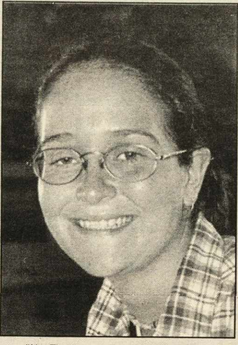
"No. That's not a good representation of the student population."