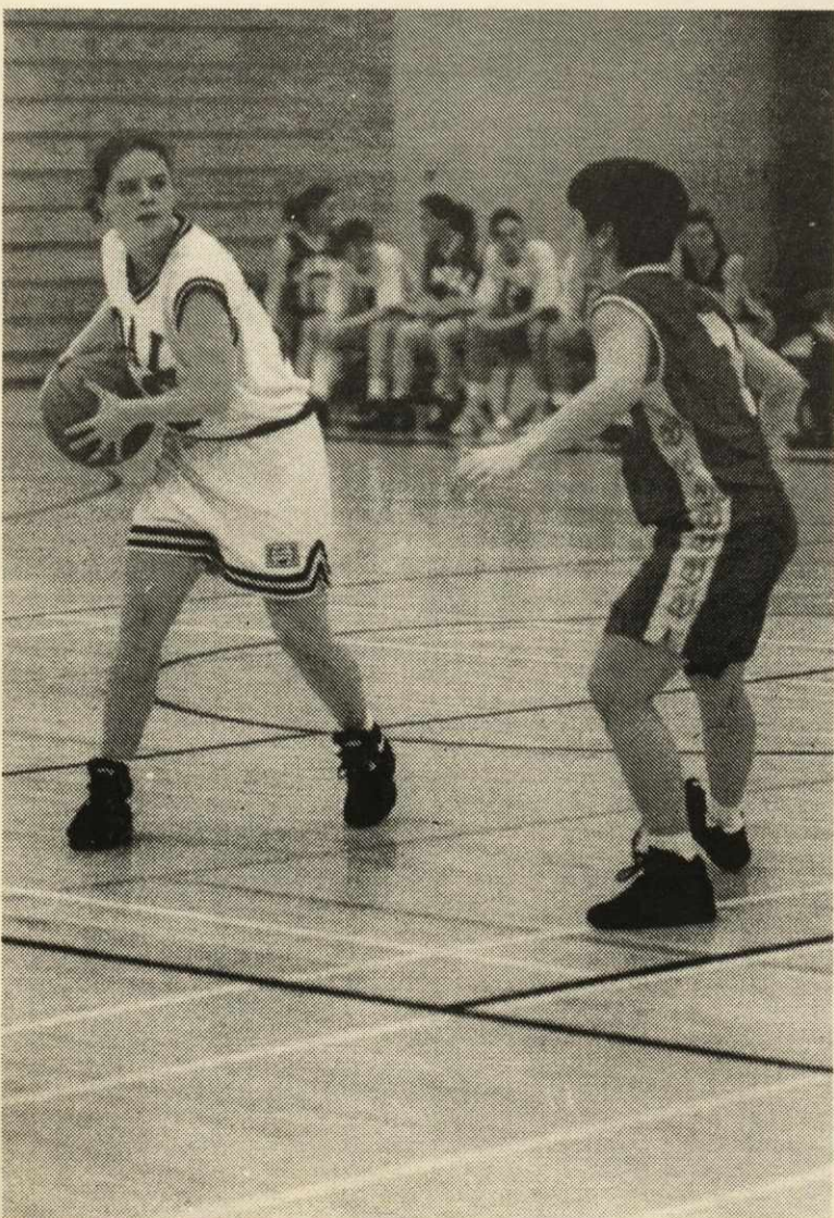
Unidentified Tiger guard eyes her defender.