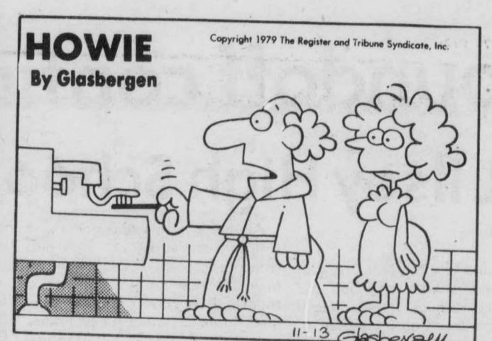
"When the city said they were going to fluoridate the water I thought..."

UNB CHRISTIAN FELLOWSHIP BOOKTABLE in Head Hall, 11:30-1:30 p.m.