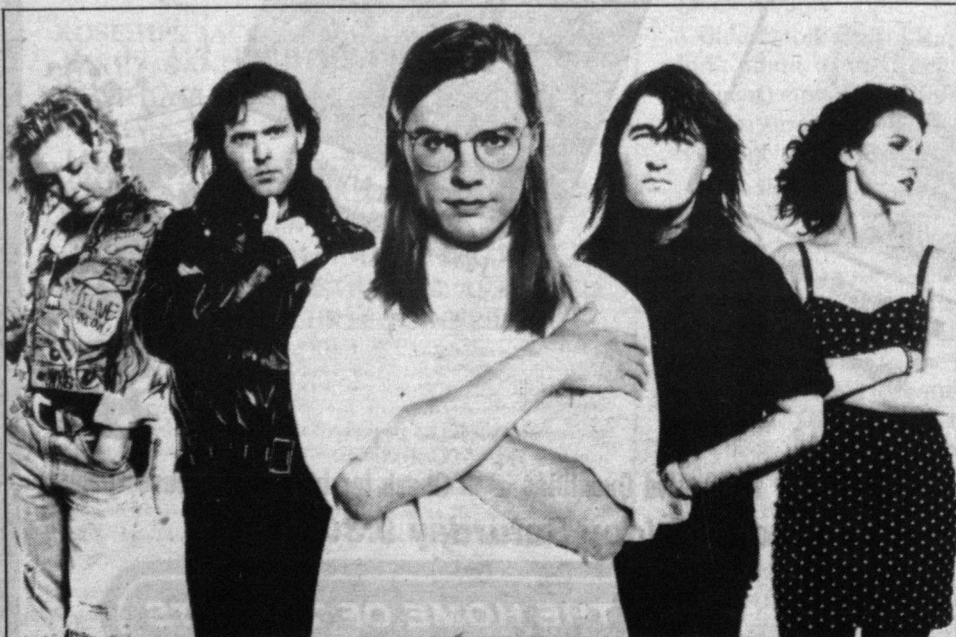
The Pursuit of Happiness: will the expatriate Edmonton band become the new Edmonton Sloppy Orchestra?