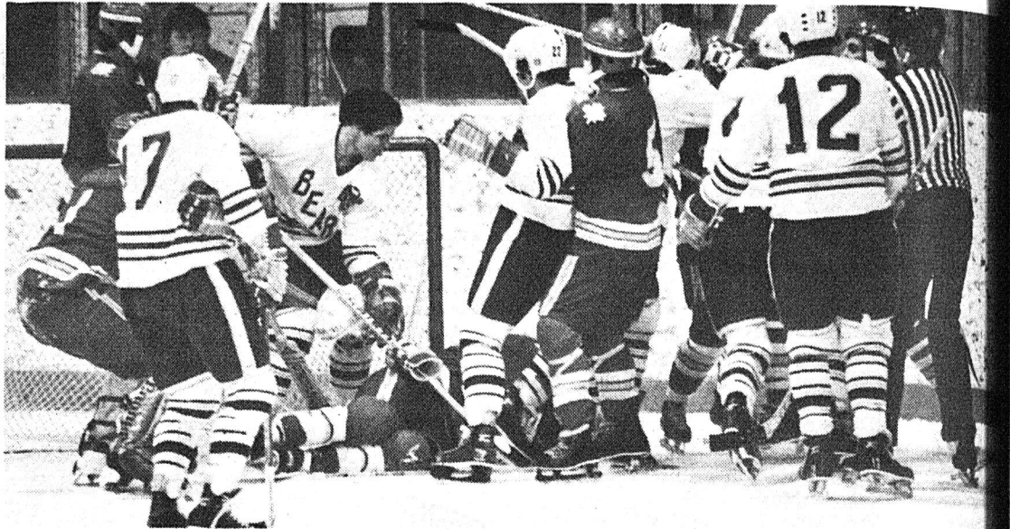
Oh, what fun! And there's more to come this weekend. Calgary has emerged as a legitimate contender so the hockey should be entertaining, for a change.