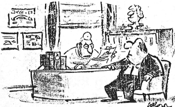
"Hmm. According to these tests, you have a fundamental perceptual handicap. You can't tell your ass from a hole in the ground."