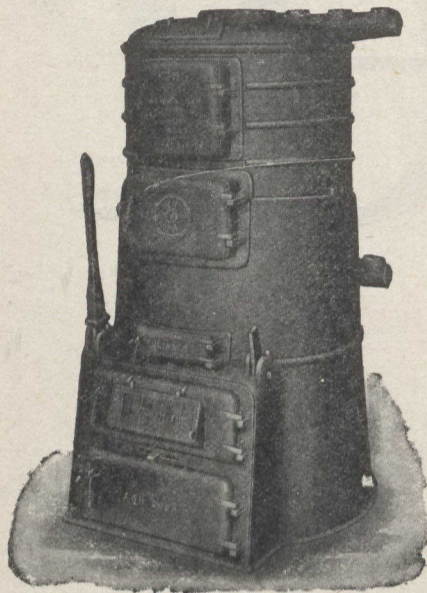
No. 6 High Base "King" Boiler, showing double shaker.

With a "KING" Hot Water Boiler and "KING" Radiators, solves the house-heating problems. . .