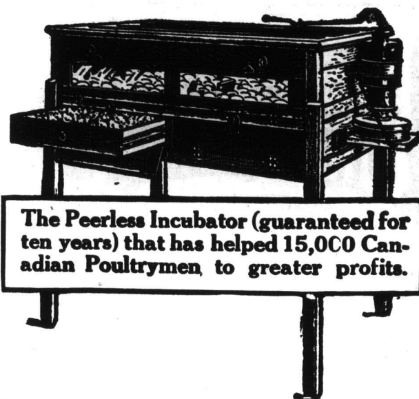
The Peerless Incubator (guaranteed for ten years) that has helped 15,000 Canadian Poultrymen to greater profits.

LEE Manufacturing Co., Ltd. 135 Pembroke Road 38