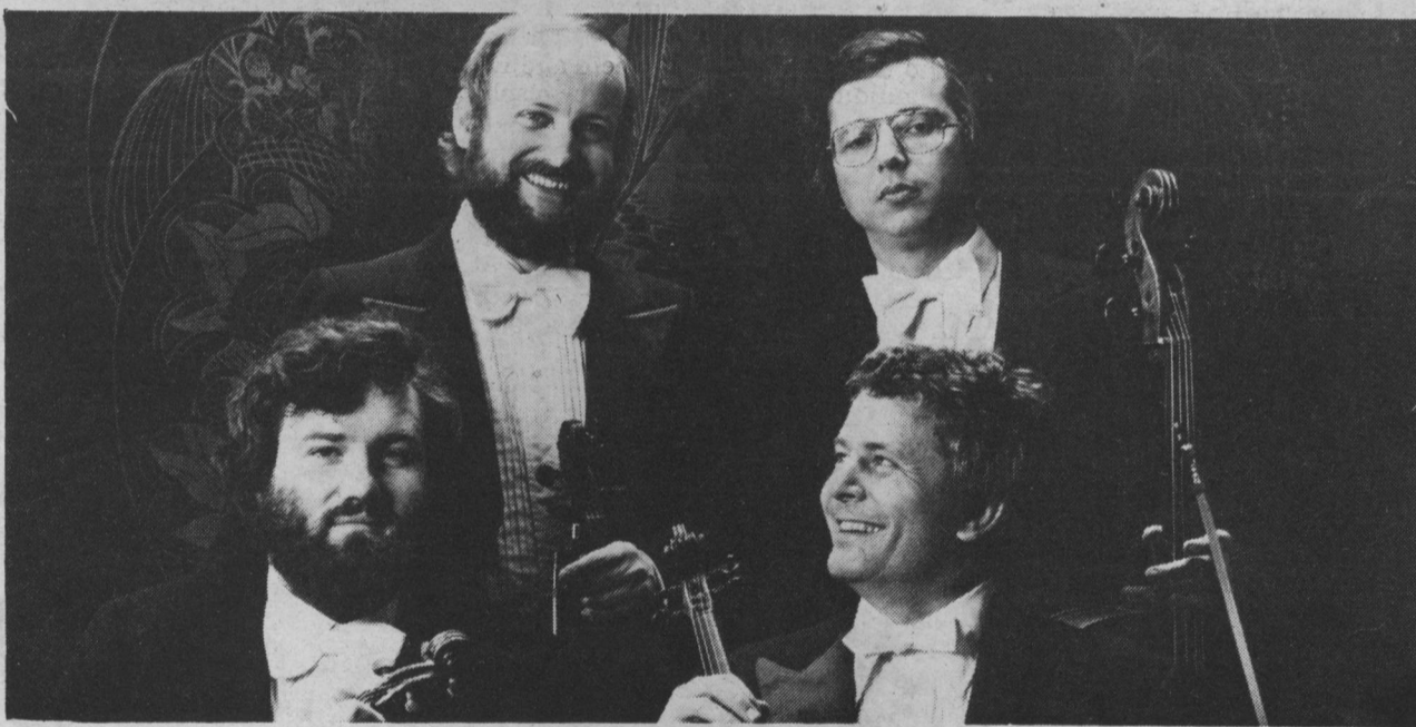
The Alban Berg Quartet of Vienna will be performing next week for the Edmonton Chamber Music Society.

George Bowering is not only a fine writer, he is an engagingly entertaining reader. All of which makes his reading something everyone should enjoy.