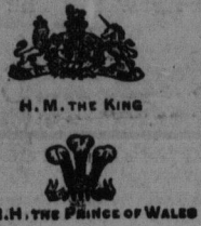
H. M. THE KING

With all the "Conleys," "O'Keefes," "Kellys" and "Murphys" who trace their ancestry to Russia and Greece, it's a wonder some slon pure Celt doesn't rise on his hind legs and start something.