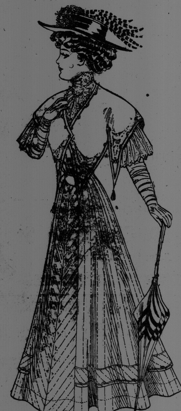
FIG. C-ONE-PIECE JACKET IN MESSALINE BRAIDED WITH SOUTACHE.