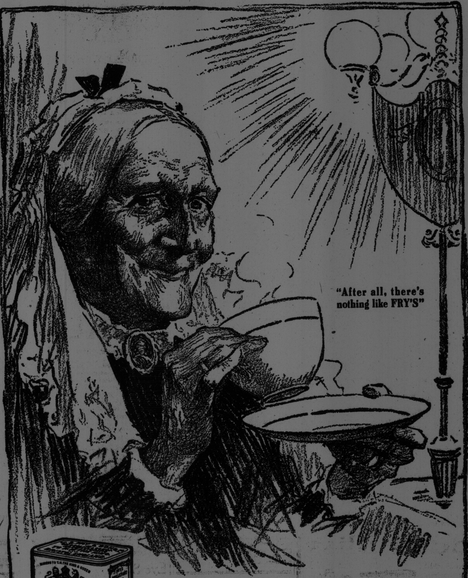
"After all, there's nothing like FRY'S"

I am confident that you will find that proper attention has been paid to the needs of our public services and due regard to economy in administration. I will leave you to your deliberations, confident that you will devote yourselves earnestly in promoting such legislation as will result in the progress and development of our province.