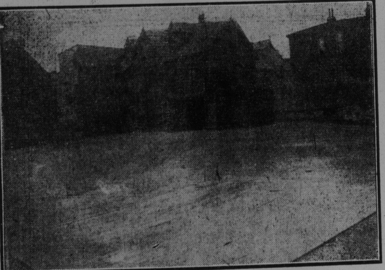
A corner of the larger grounds looking from the school building.