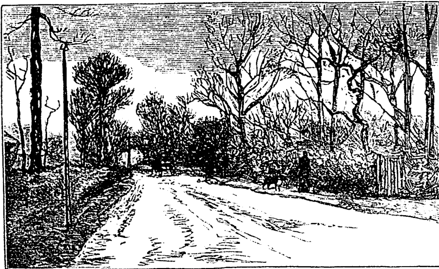
THE WINDSOR ROAD, SHOWING THE WICKET GATE THROUGH WHICH HER LADYSHIP PASSED INTO THE PLANTATION WHERE SHE WAS ATTACKED