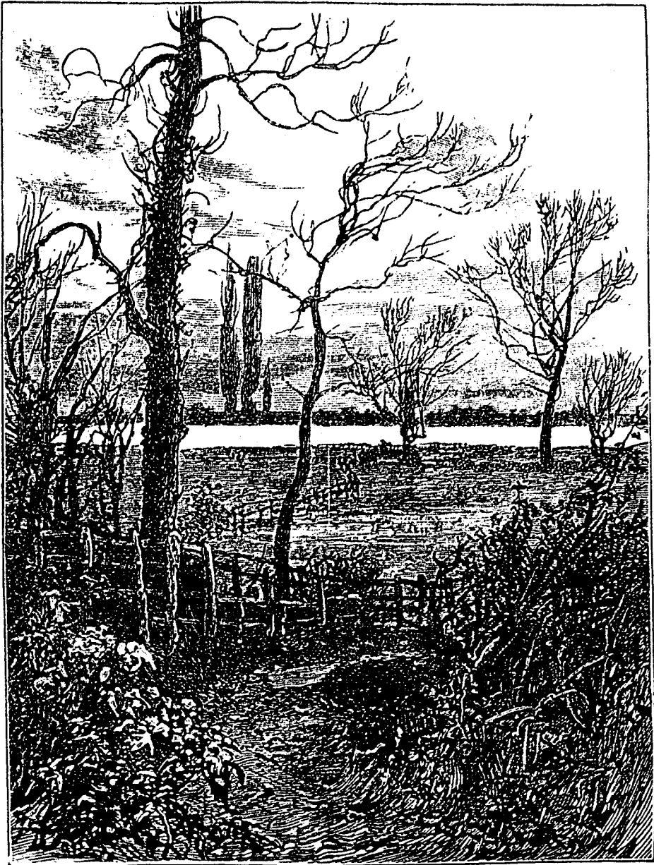
SCENE OF THE ATTACK