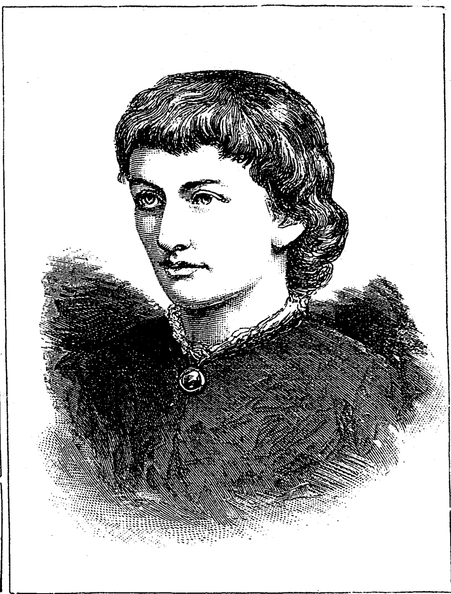
LADY FLORENCE DIXIE