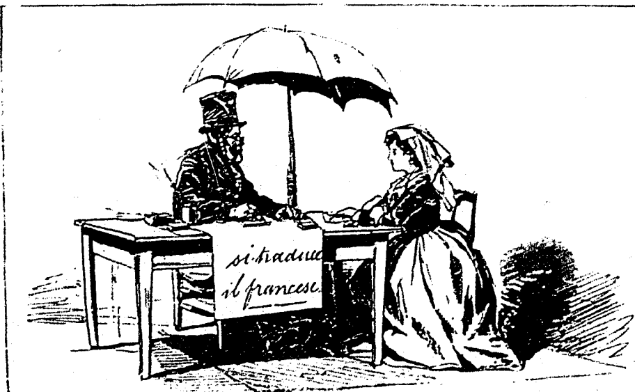
THE LETTER WRITER