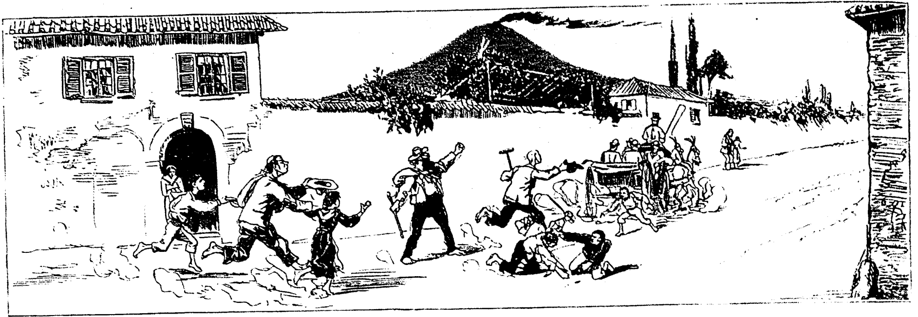
ON THE ROAD TO POMPEII