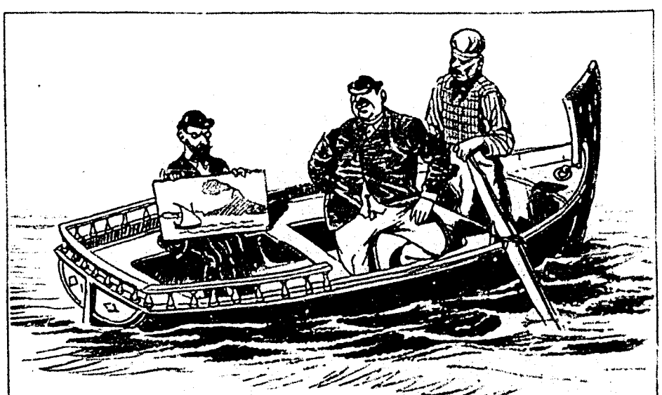
ART IN NAPLES