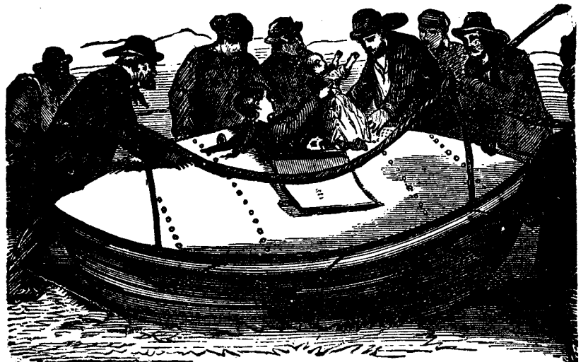
OPENING THE LIFE CAR.