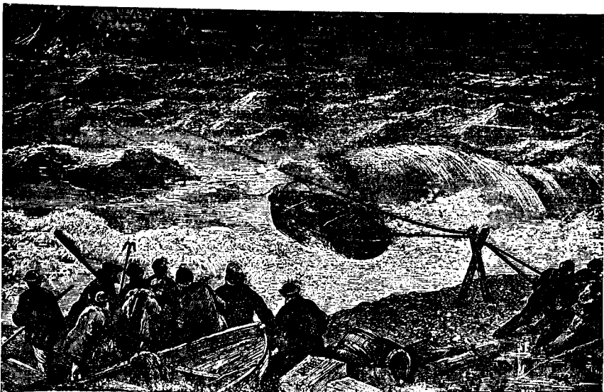
PULLING THE LIFE-CAR TO SHORE.

Thus, redeemed souls rejoice to be free from the wrath which hung over them, forgetting the old haunts of sin which so lately bound them, now giving praise to God