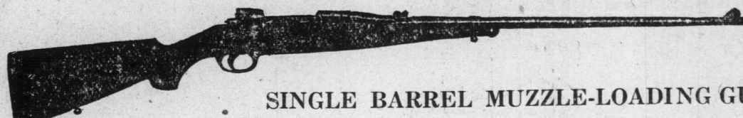
SINGLE BARREL MUZZLE-LOADING GUNS.

WEDNESDAY—EPISODE 21 OF 'THE MILLION DOLLAR MYSTERY.' DON'T MISS TO-DAY'S SHOW AT THE NICKEL—IT'S GREAT.