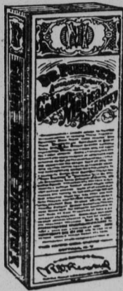
Dr. Pierce's Pleasant Pellets regulate and invigorate Stomach, Liver and Bowels.

You can't afford to accept any medicine of unknown composition as a substitute for "Golden Medical Discovery," which is a medicine of known composition, having a complete list of ingredients in plain English on its bottle-wrapper, same being attested as correct under oath.