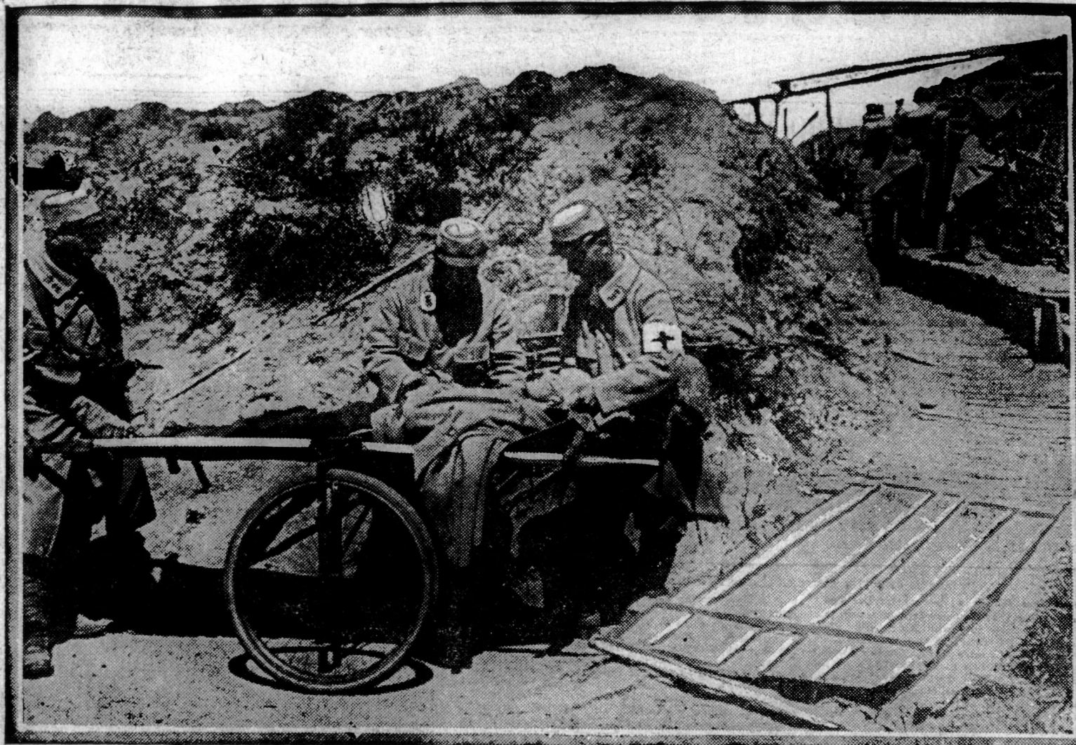
The wheeled litter now being used by French ambulance corps to remove wounded men from the fire zone to the field dressing stations. The photo shows first aid being administered right in the trenches by Red Cross men.