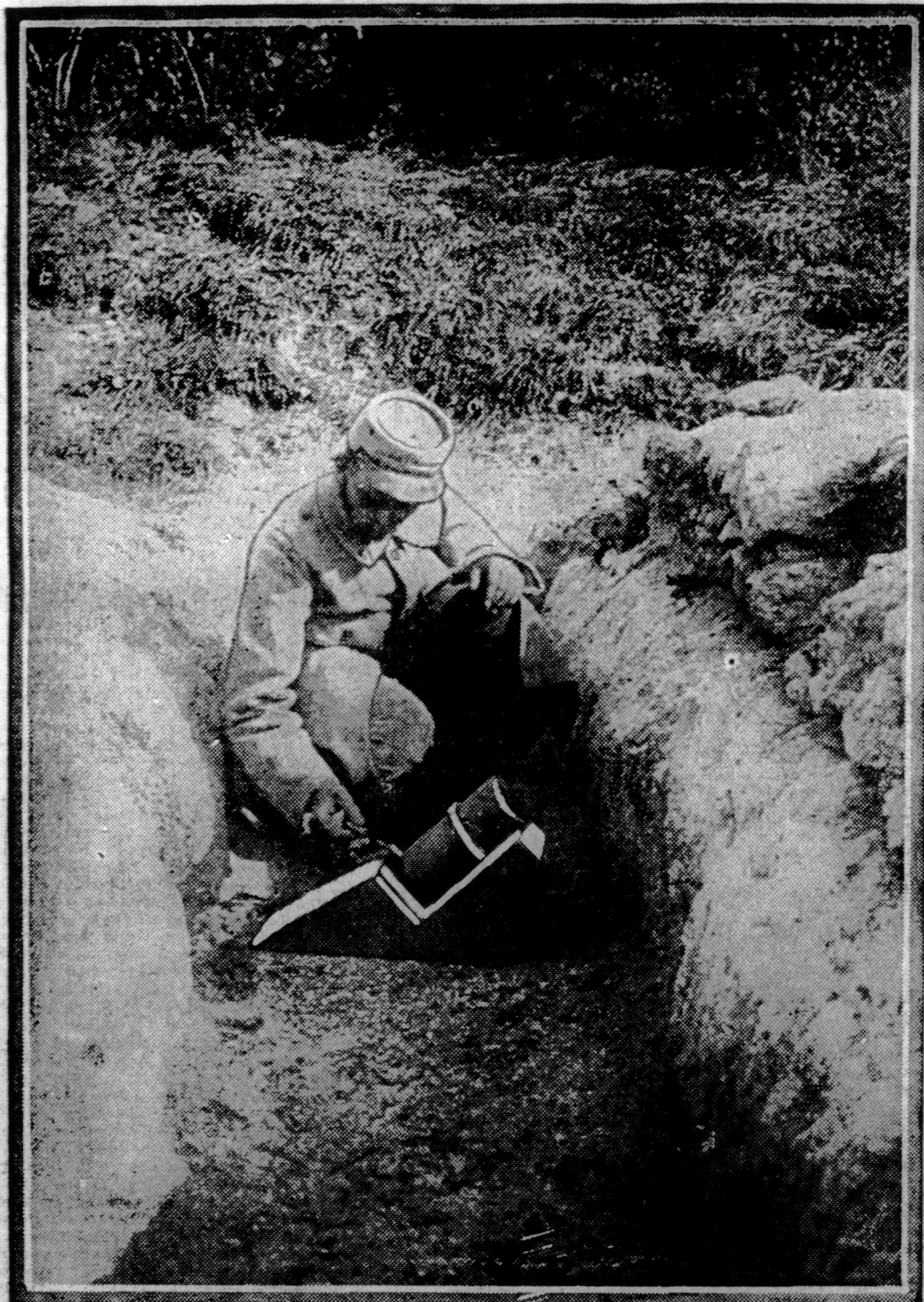
An official French photograph of a soldier touching off a trench bomb thrower. These simple devices differ little from the "home-made" cannons boys make from a piece of steel pipe.