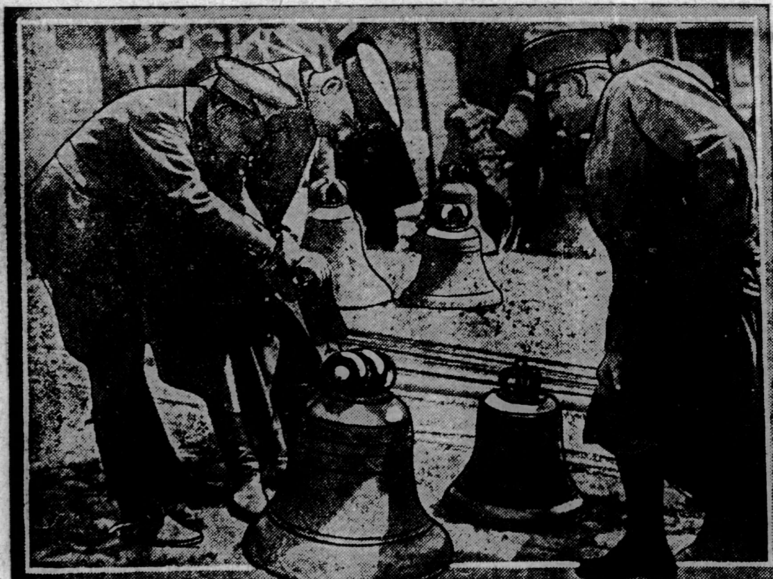
Bells from Warsaw churches being taken down by Russian soldiers for removal into the interior lest they be fed by the city's captors into the hungry maw of Krupp's furnaces.