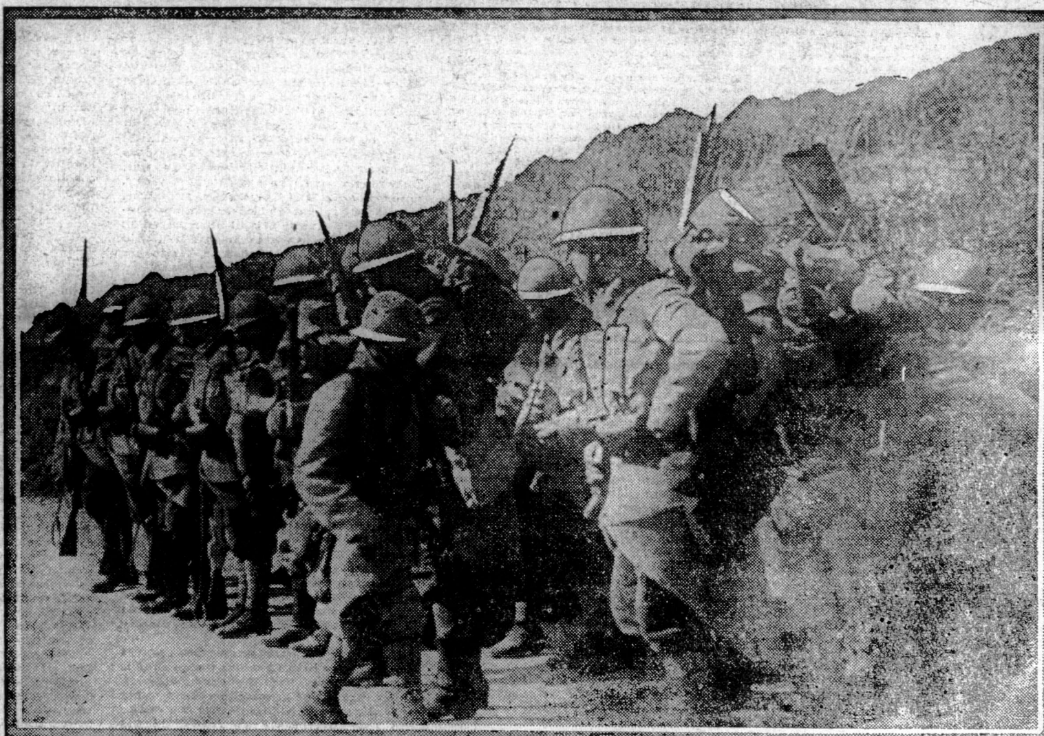
Showing the new steel helmets which the French authorities announced a few weeks ago would displace the former cap, and which have even now become common in the trenches of the legions of France.