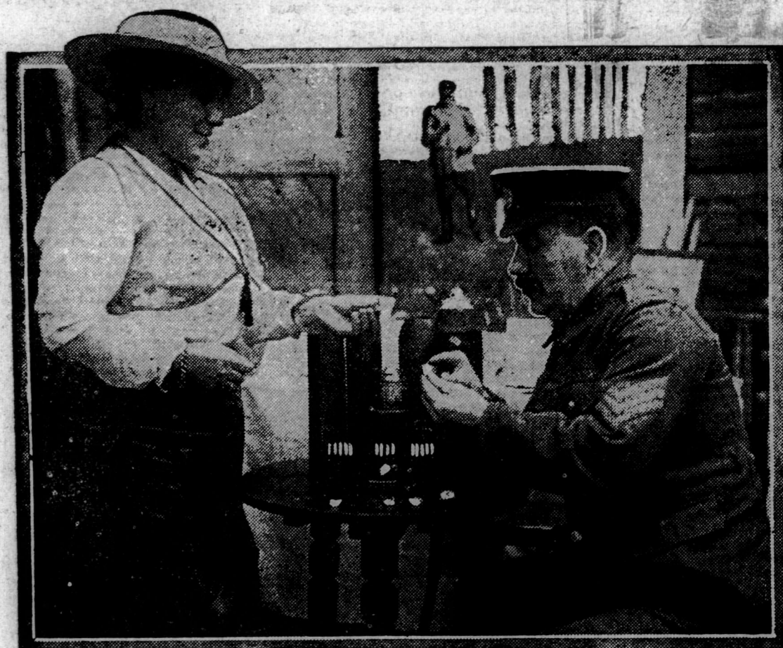
Aluminum rings made from the skeleton frames of wrecked Zeppelins, and German shell fuses are all the rage in Europe. The photo shows a convalescent Tommy making a number of these rings.